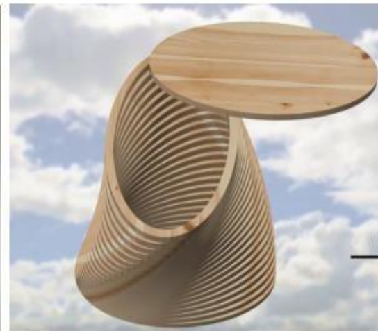
Modern design instrument shelter